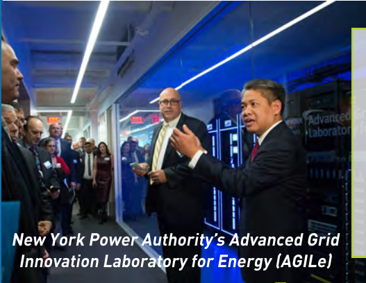
New York Power Authority's Advanced Grid Innovation Laboratory for Energy (AGILE)