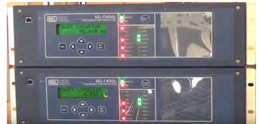
SEL's new T400L (Time Domain Protection) connected in the loop with TWRT

The emergence of traveling wave fault location is a breakthrough in line protection, improving power system performance, transient stability margins, and public safety, and limiting equipment damage. The new, ultra-high-speed protective devices using these algorithms can locate faults with unprecedented accuracy, recording events in the MHz sampling rate range and tripping securely in a few milliseconds. Now, for the first time ever, the RTDS Simulator offers a platform for testing travelling wave protection devices in a closed loop.