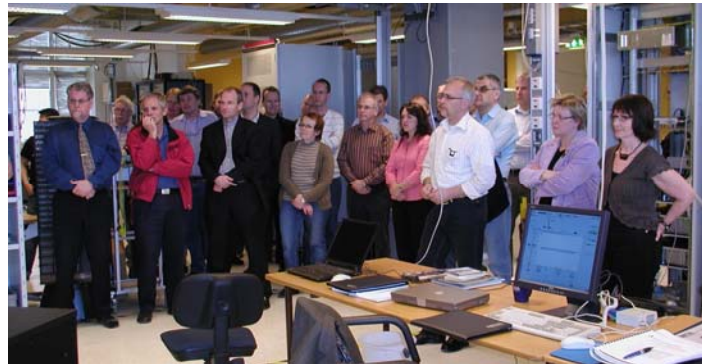
Ribbon Cutting Ceremony for Upgraded RTDS Simulator

The ABB FACTS group has been using the RTDS Simulator for many years and has recently upgraded their system to the latest in RTDS technology. ABB was convinced to go ahead with the upgrade after evaluating the performance of a test system consisting 1 rack of RTDS hardware.